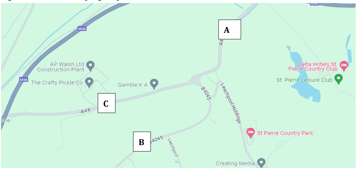
Table 10: Servenside Localised Analysis